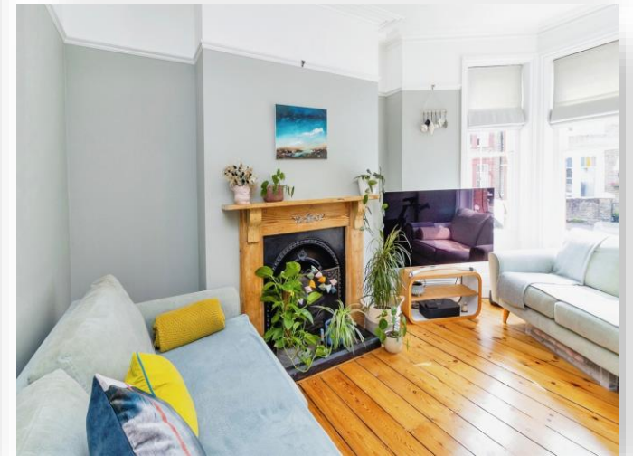
Grove Road, Leighton Buzzard, LU7 1SF