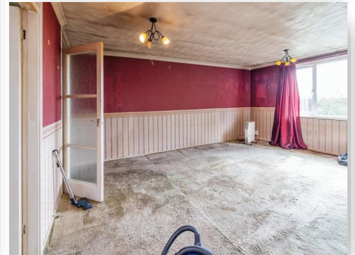
Bideford Court, Bideford Green, Leighton Buzzard, LU7 2TN