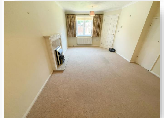
Middleton Way, Leighton Buzzard, LU7 4BQ