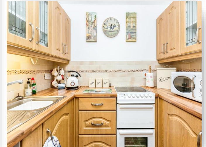
Rosebery Court, Water Lane, Leighton Buzzard, LU7 1DL