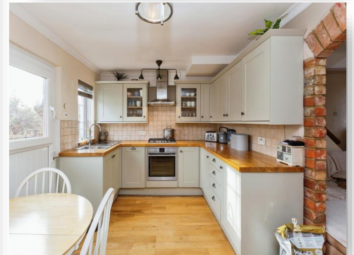
Dunton Road, Stewkley, Leighton Buzzard, LU7 0HY