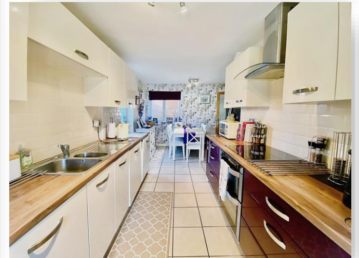
Saxons Close, LEIGHTON BUZZARD, LU7 3LT