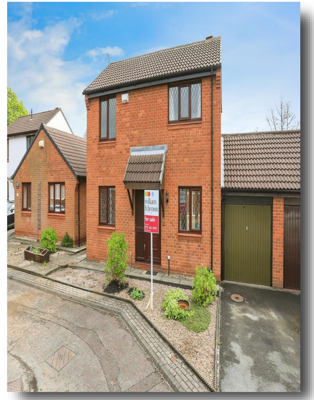
High Bank Approach, Leeds LS15 9DA