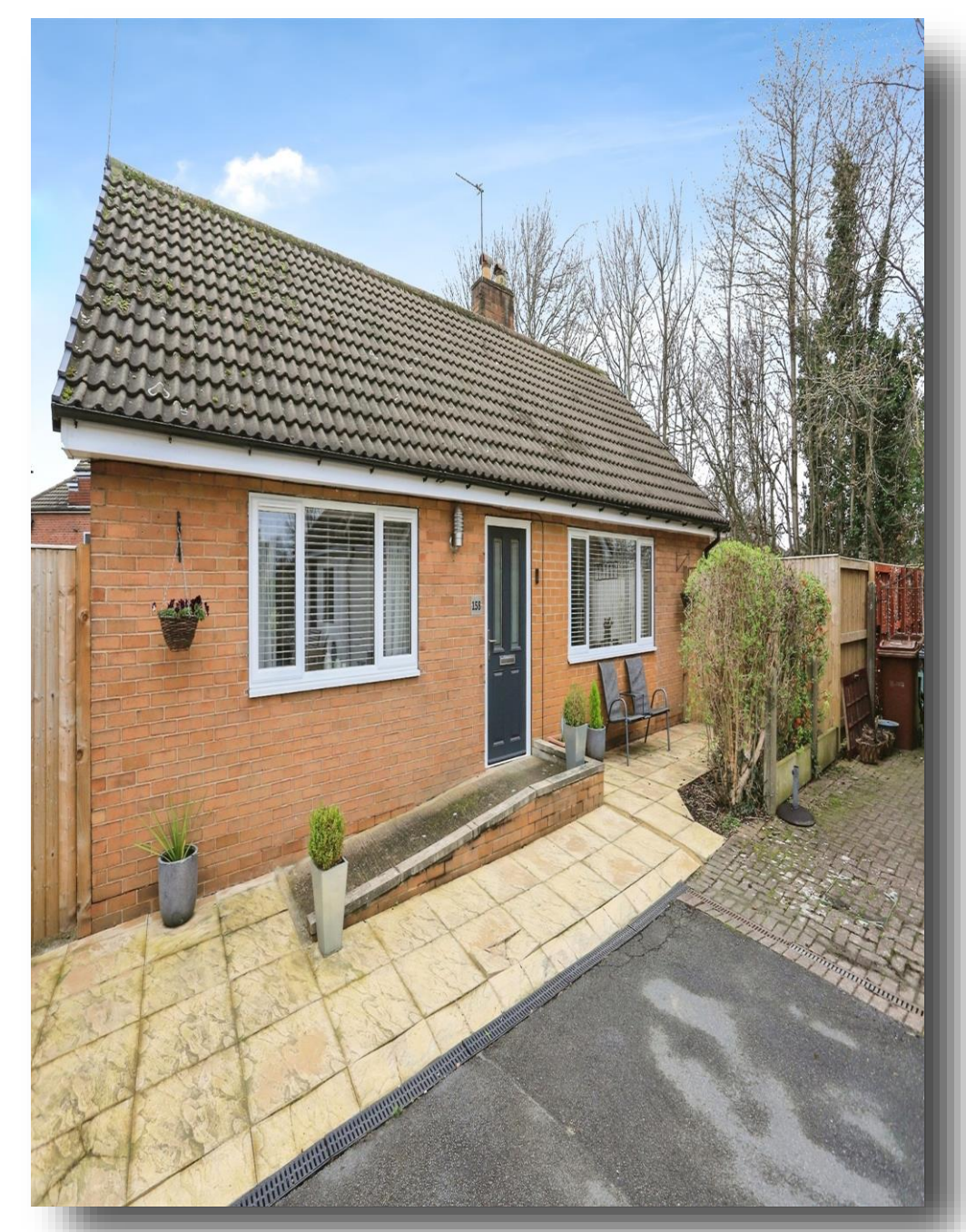
Ring Road, Halton Leeds LS15 7AD