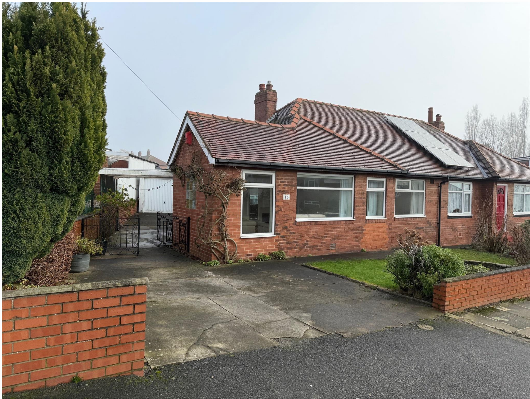
Pinfold Road, Leeds LS15 0PN