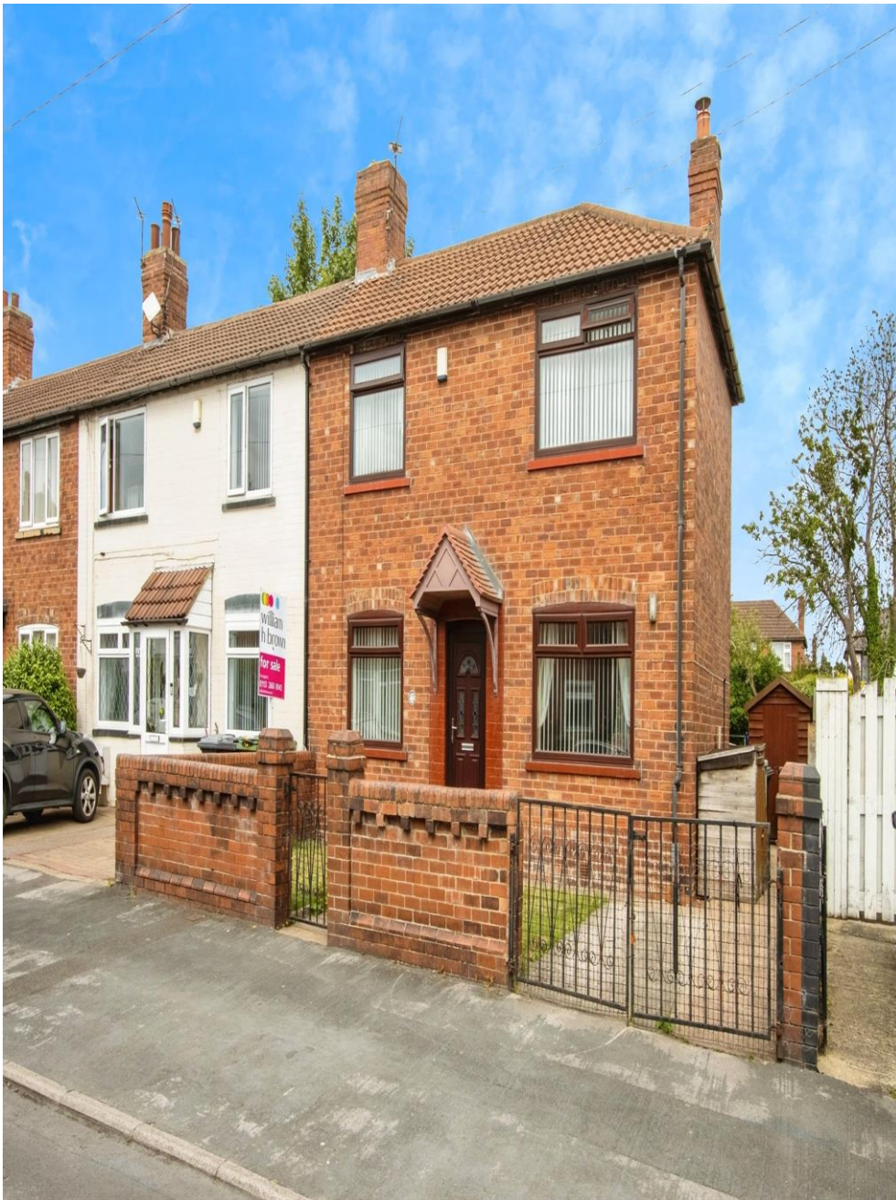
Skelton Avenue, Leeds LS9 9HE