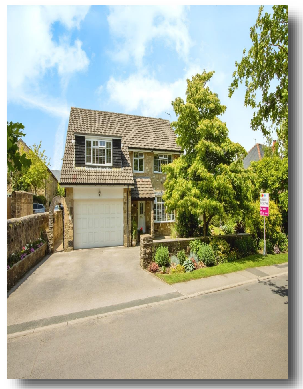
Butts Garth, Thorner Leeds LS14 3DA