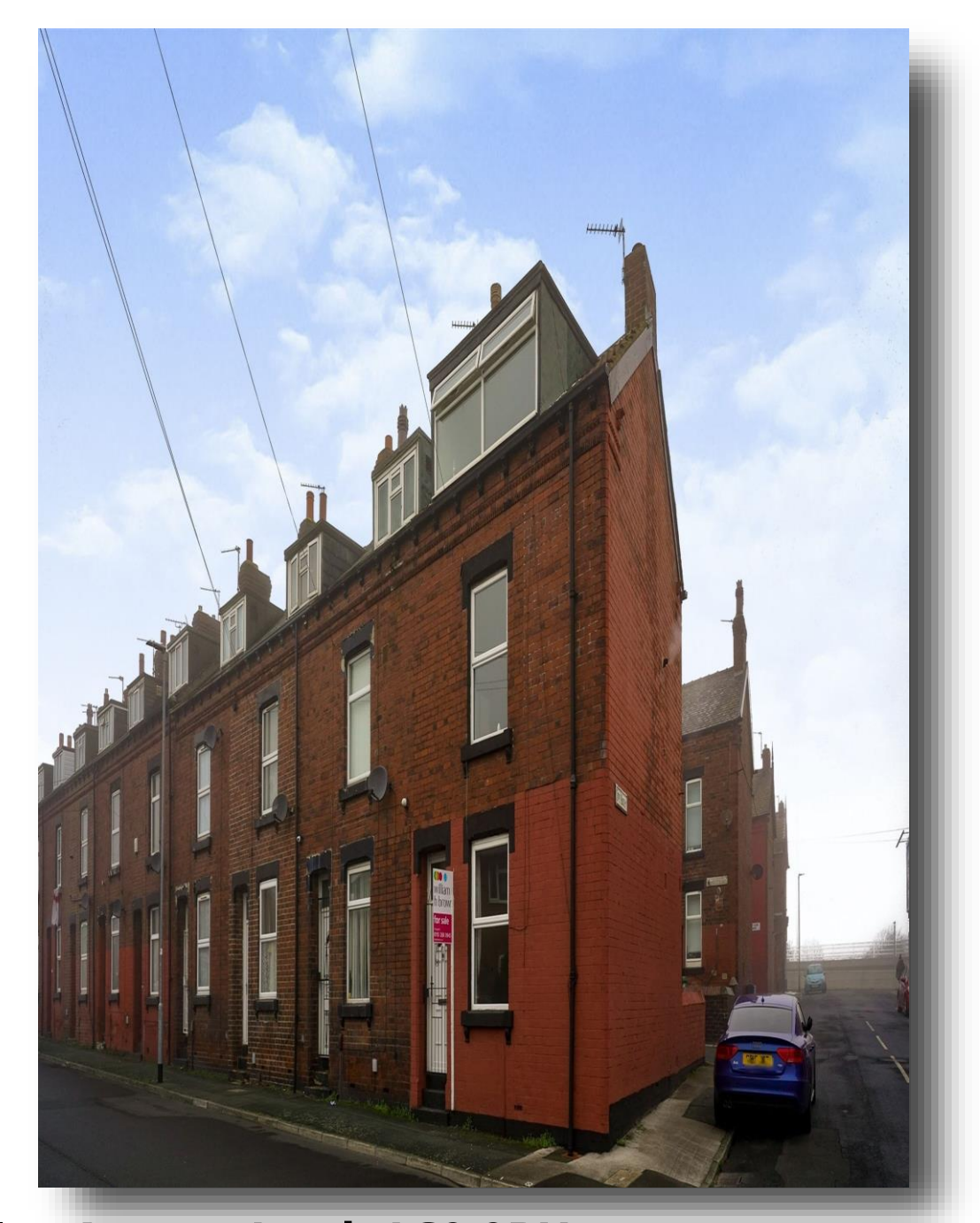
Ivy Avenue, Leeds LS9 9BU