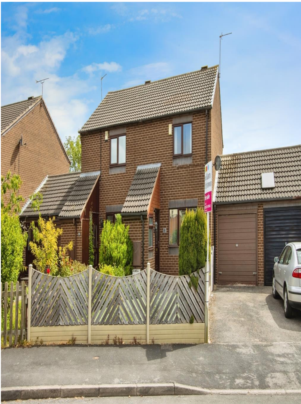
Birchfields Rise, Leeds LS14 2HU