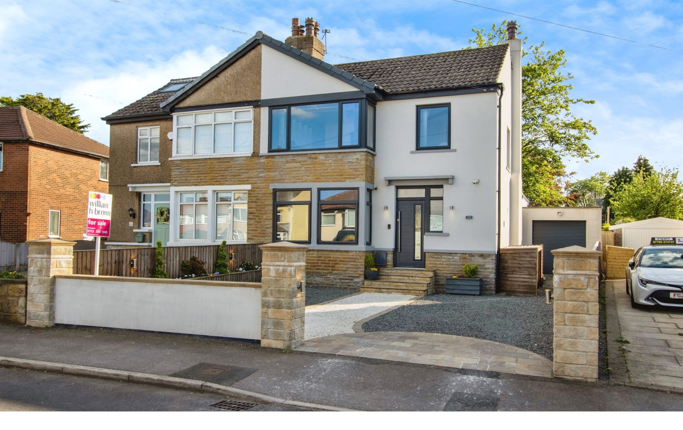
The Haven, Leeds LS15 7AT