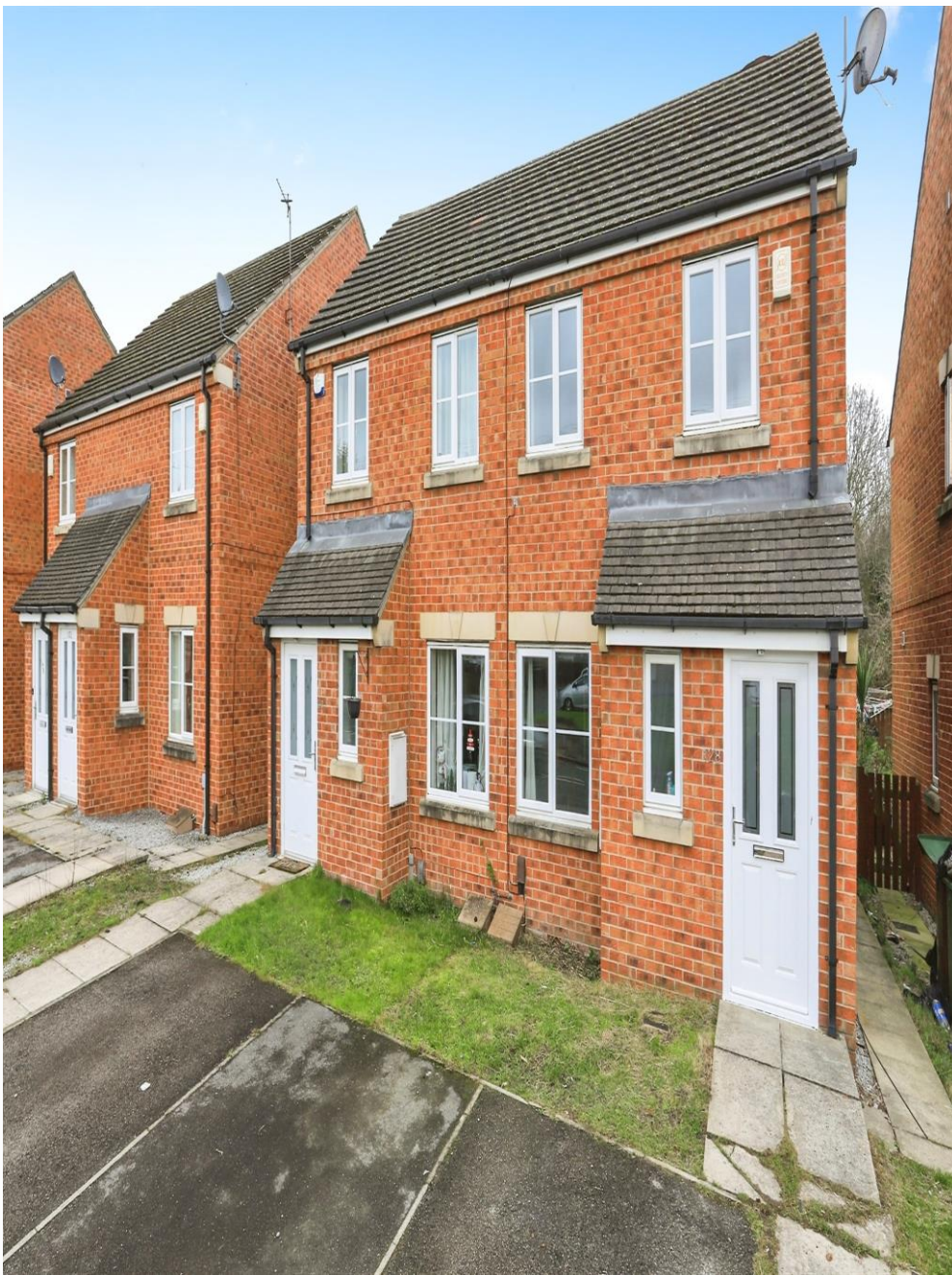
Stanks Drive, Leeds LS14 5QD