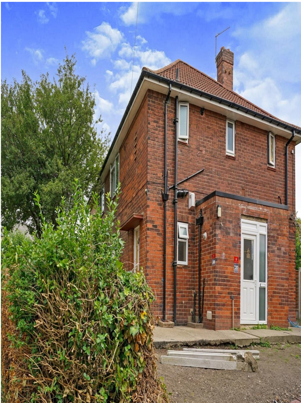
Brooklands Lane, LEEDS LS14 6QG