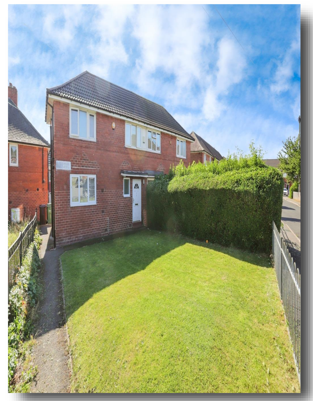
Stainmore Place, Leeds LS14 6BU