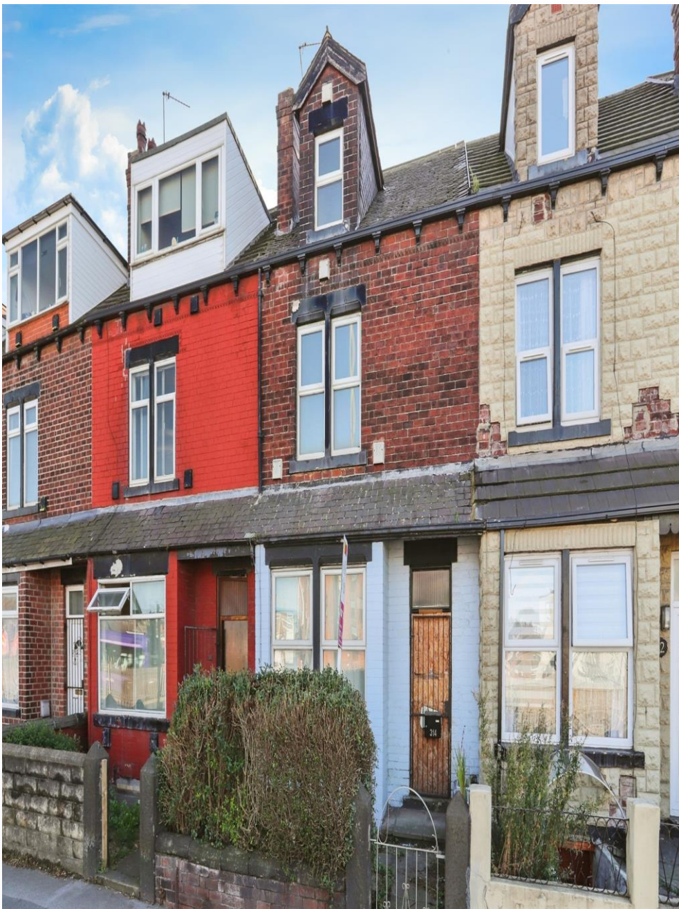
York Road, Leeds LS9 9DN