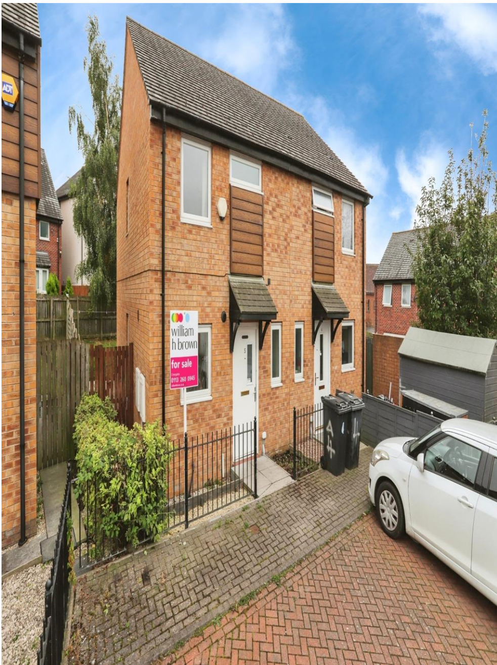
Parkside View, Seacroft Leeds LS14 6FG