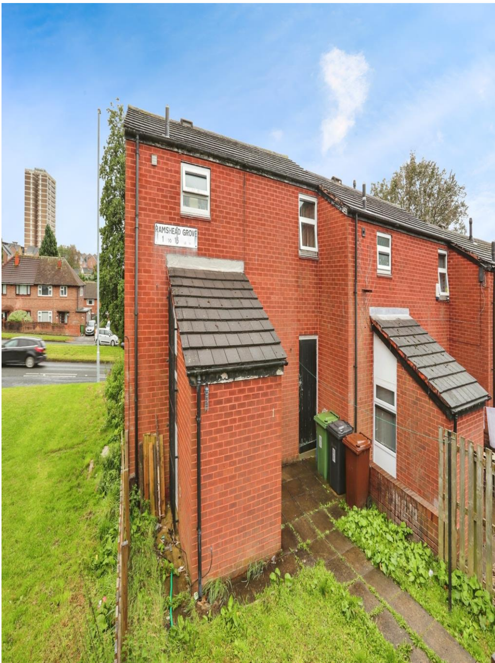
Ramshead Grove, Leeds LS14 1PL