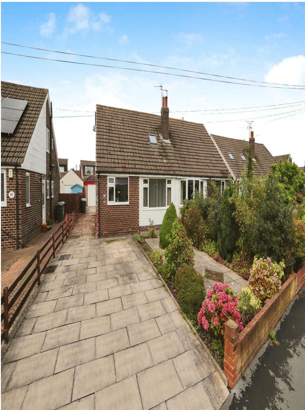
Whinmoor Crescent, Leeds LS14 1EQ