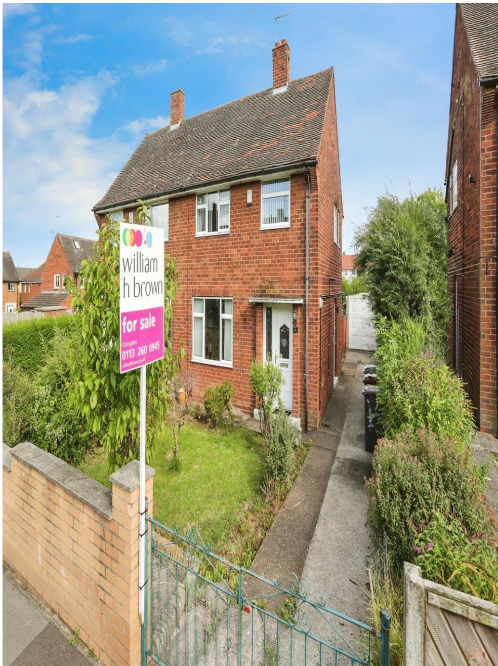
Stanks Road, Leeds LS14 5PN