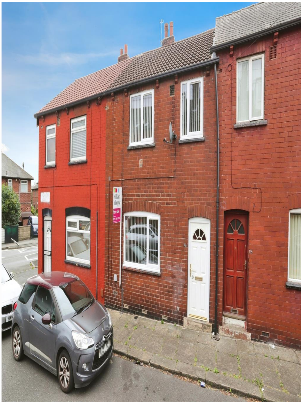
Thornleigh Mount, Leeds LS9 8QW