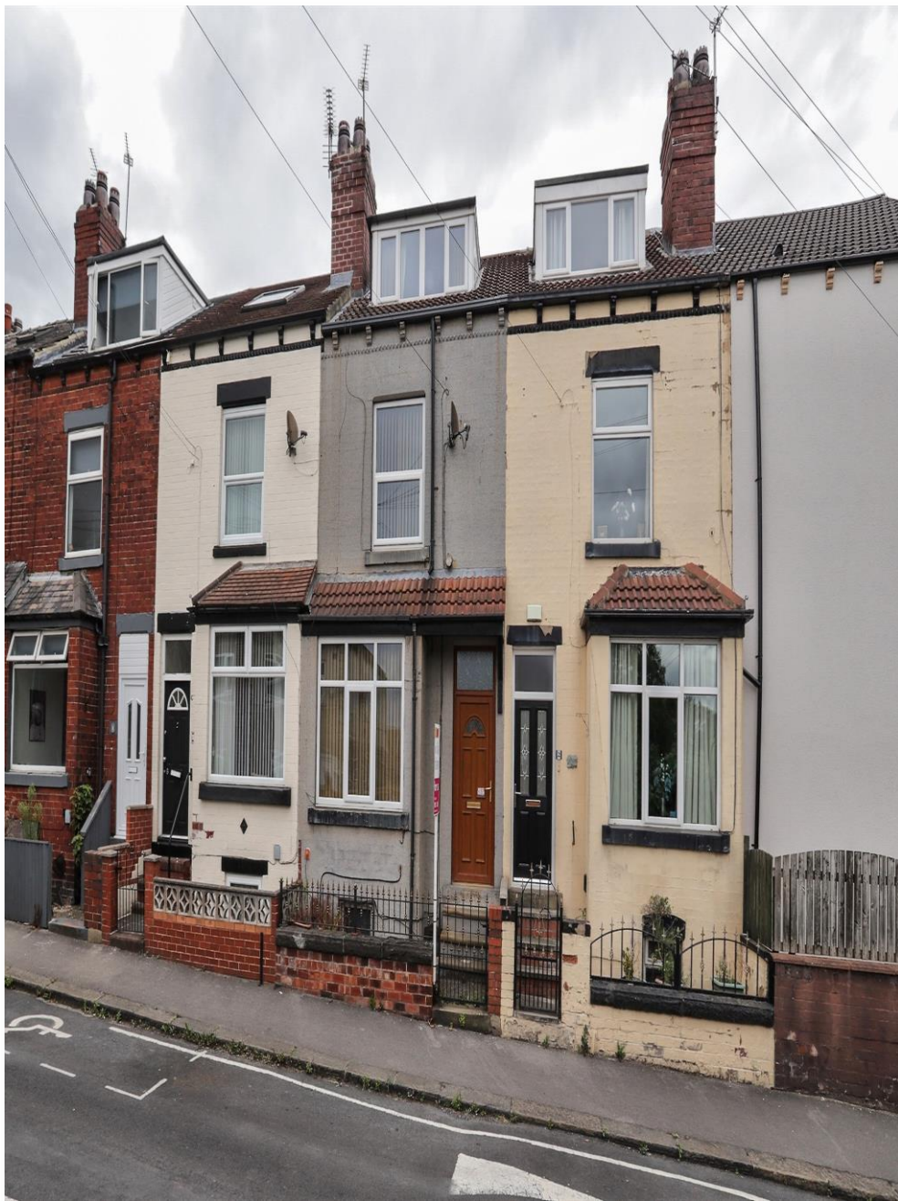
Ecclesburn Street, Leeds LS9 9DB