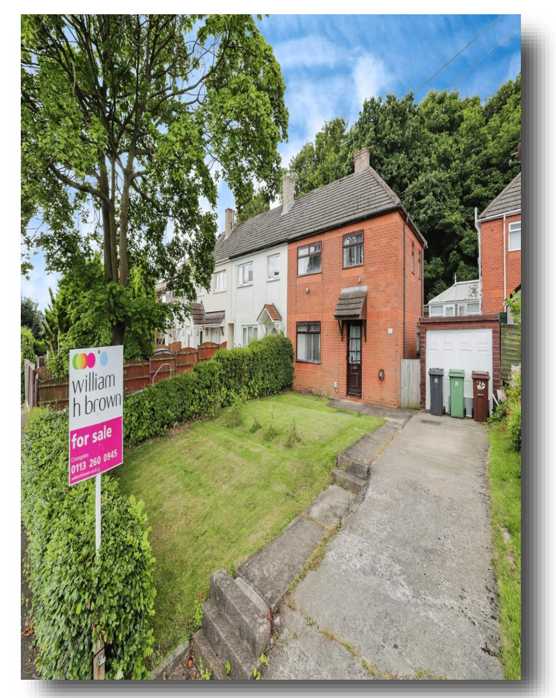
Eastwood Drive, Leeds LS14 5HU