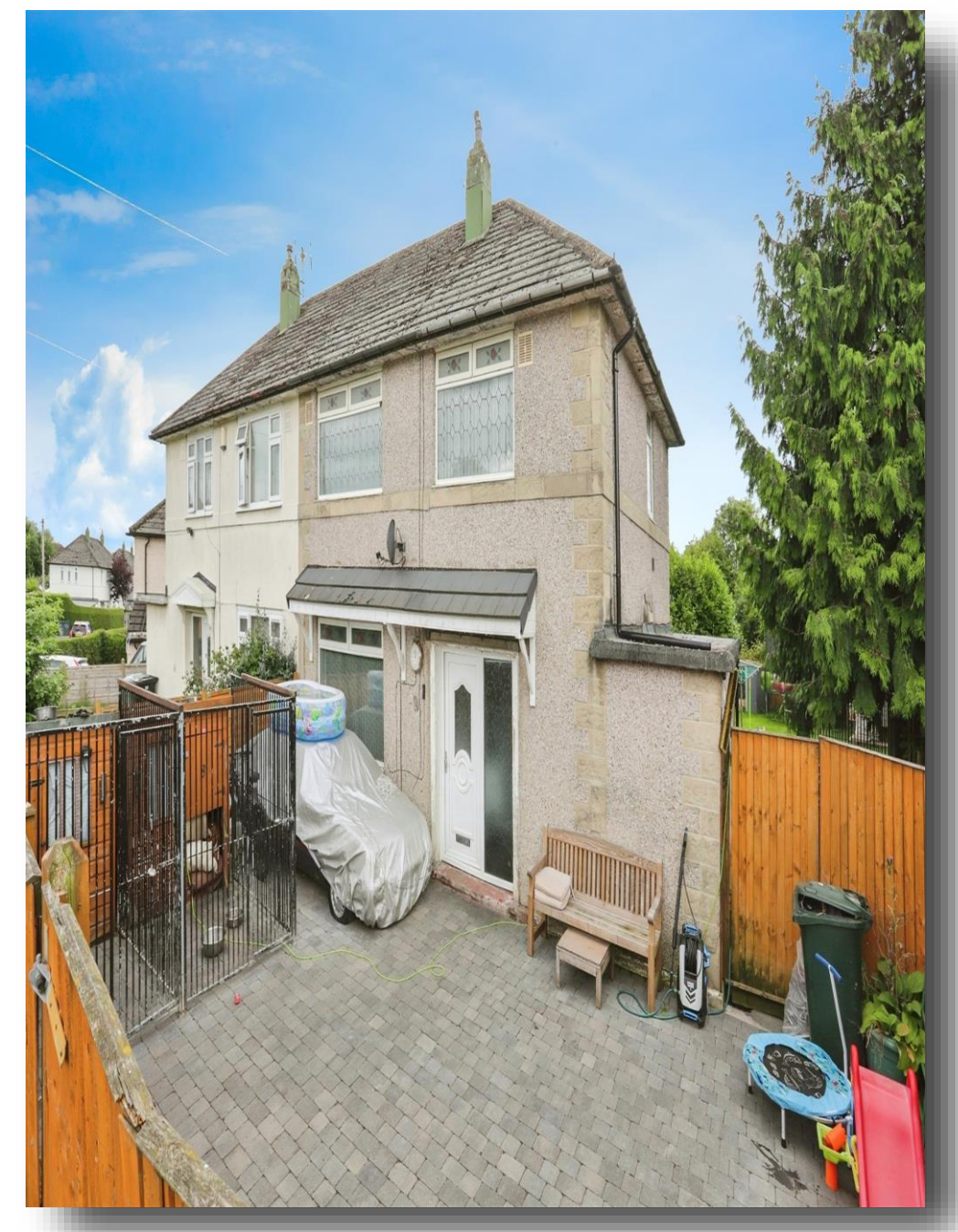
Brooklands Lane, LEEDS LS14 6QH