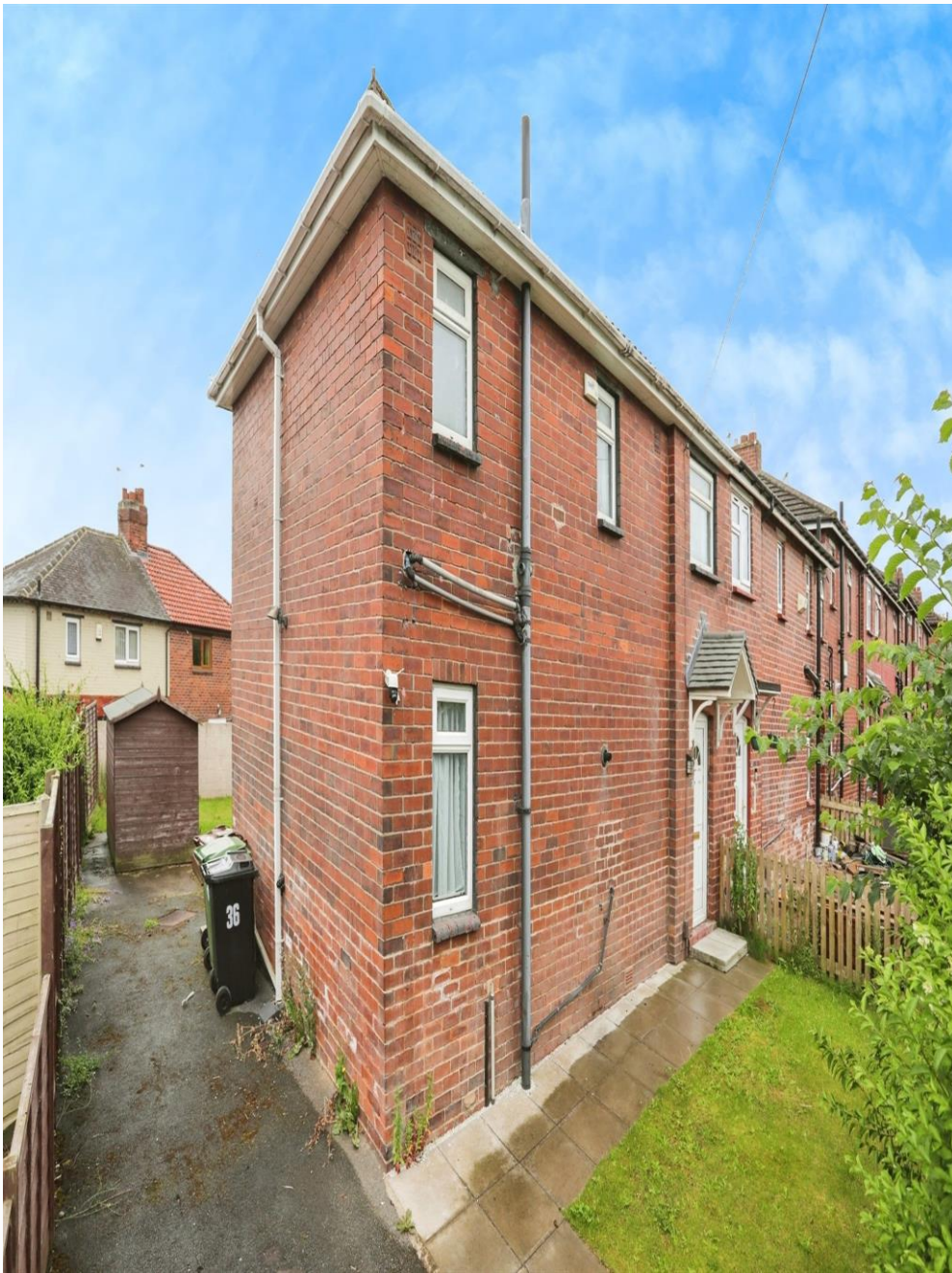
Coldwell Road, LEEDS LS15 7HA