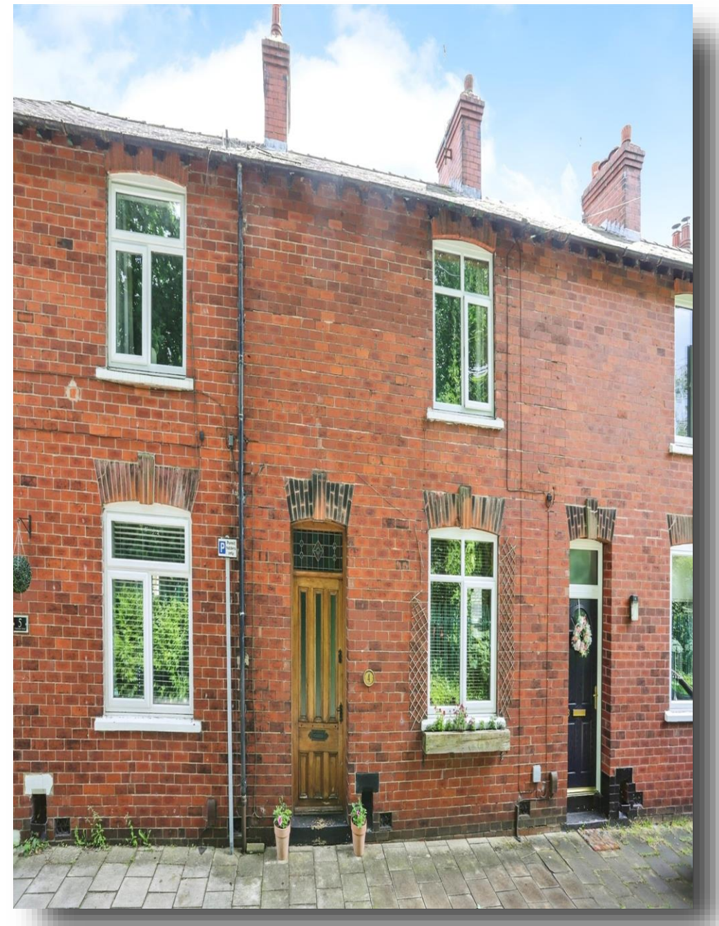
Station View, Leeds LS15 8BY