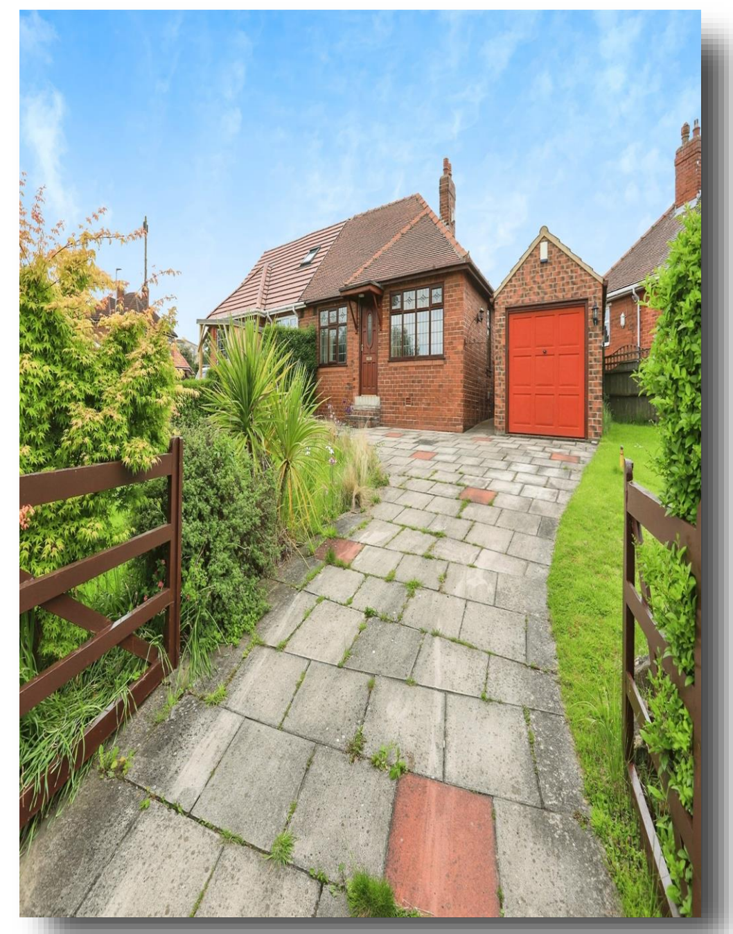
Pinfold Mount, Leeds LS15 0PP