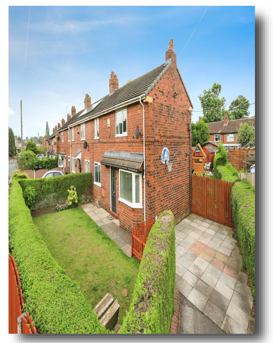
Poole Crescent, Leeds LS15 7LU