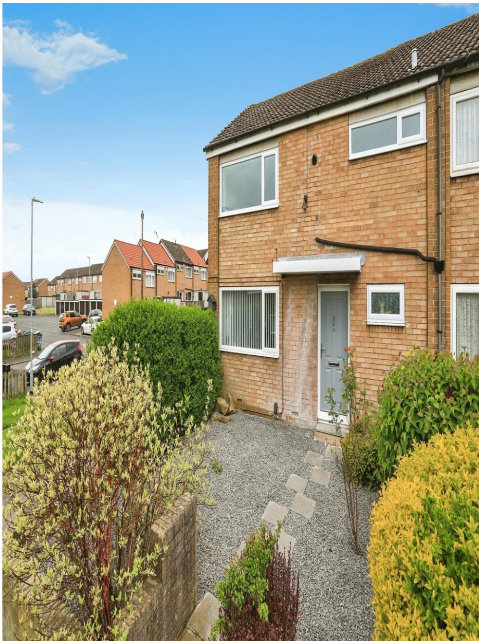
Langbar Green, LEEDS LS14 5EF