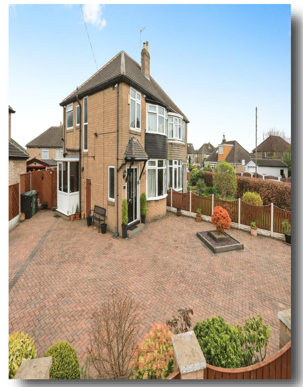
Lulworth View, LEEDS LS15 8PG