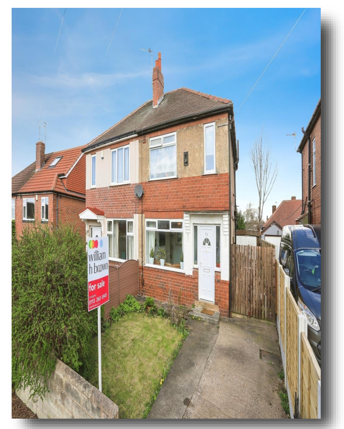
Sandway, Leeds LS15 7NX