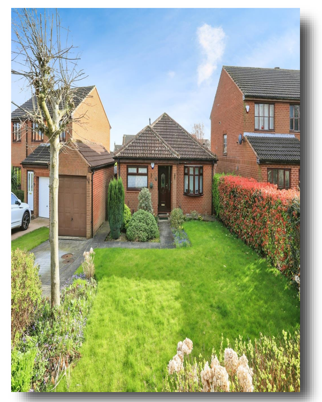
Cranewells Vale, Leeds LS15 9HF