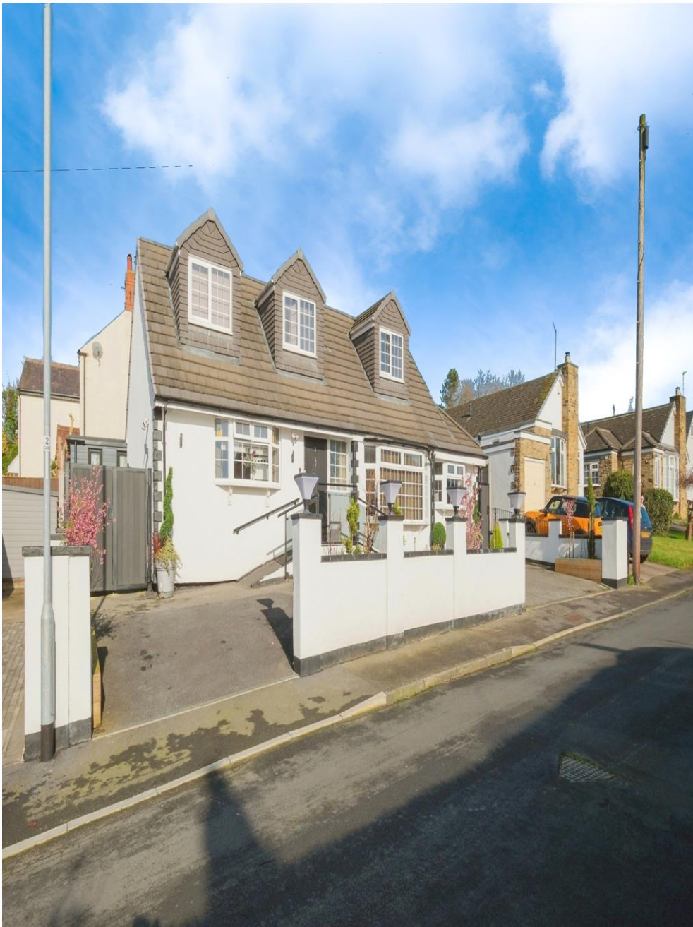
Greystones Close, Aberford Leeds LS25 3AR