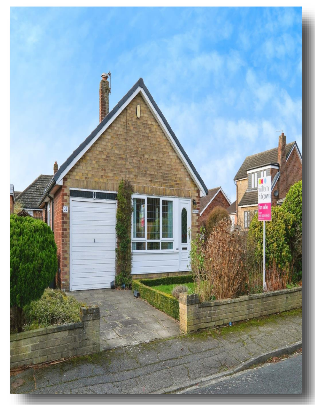
Templegate Close, Leeds LS15 0PJ