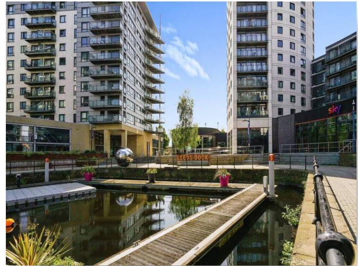
Clarence House The Boulevard, Leeds LS10 1LG