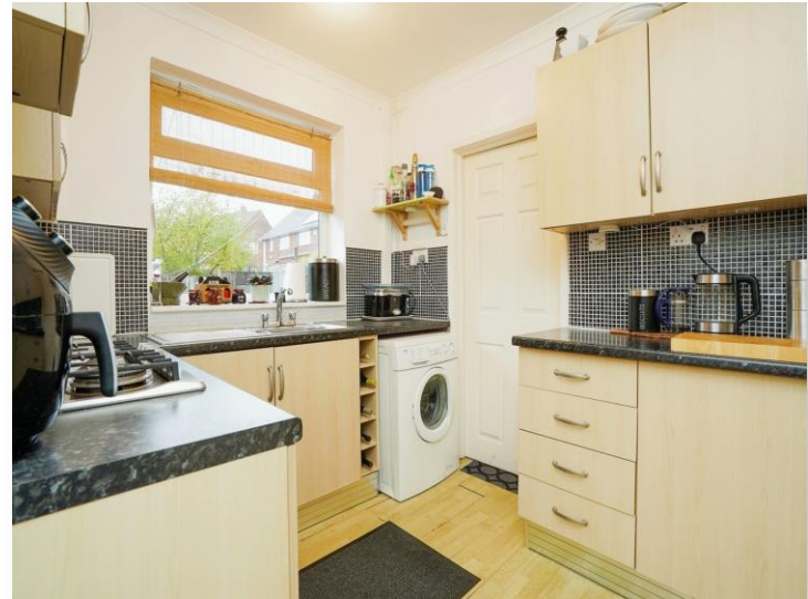
Stocks Road, Leeds LS14 6LA