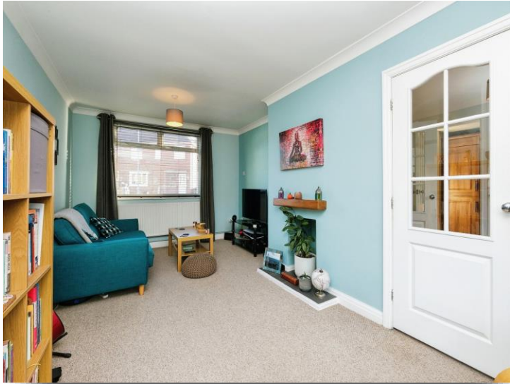
Queensway, Garforth Leeds LS25 1AZ