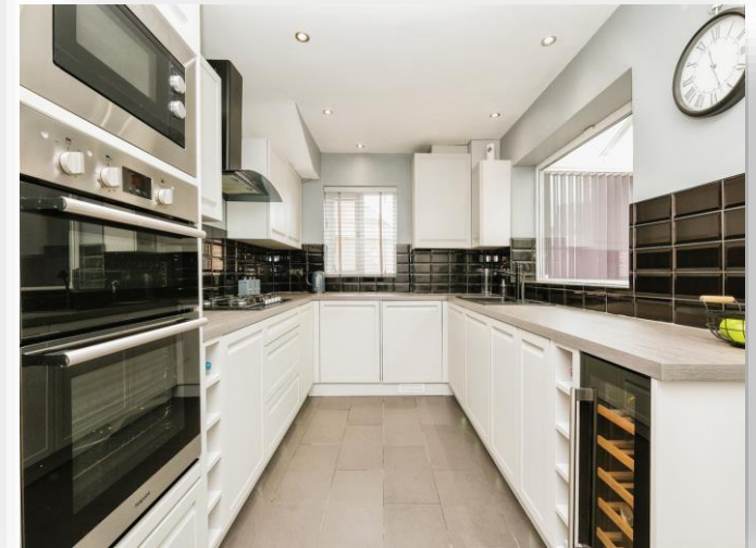
Birchfields Rise, Leeds LS14 2JD