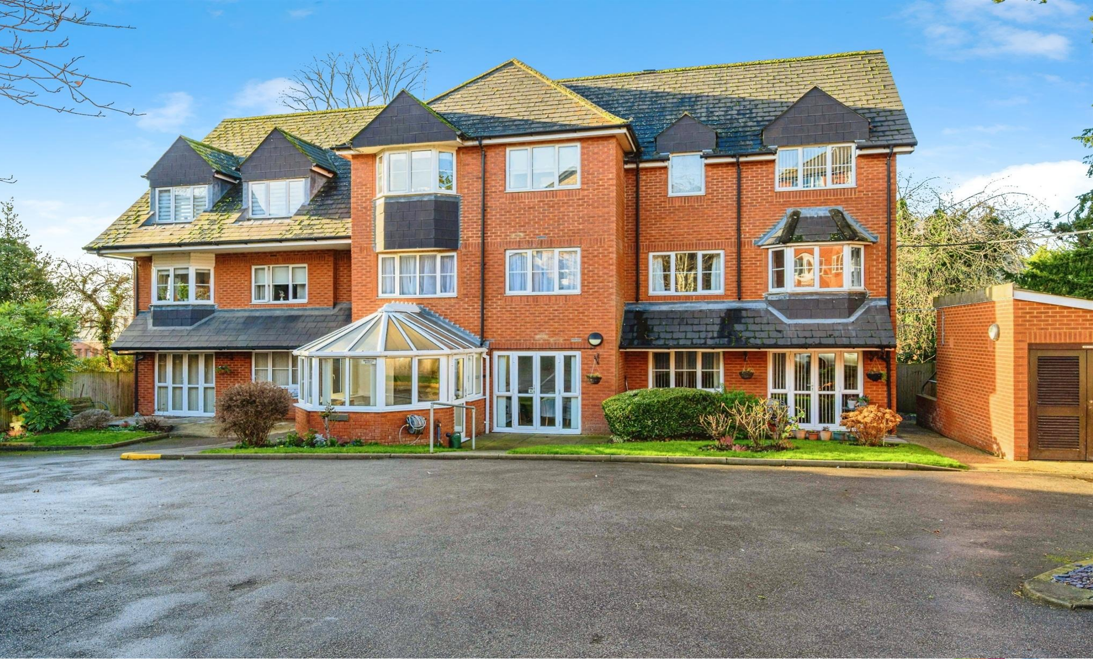
Albyn House Alexandra Road,HEMEL HEMPSTEAD HP2 5BE