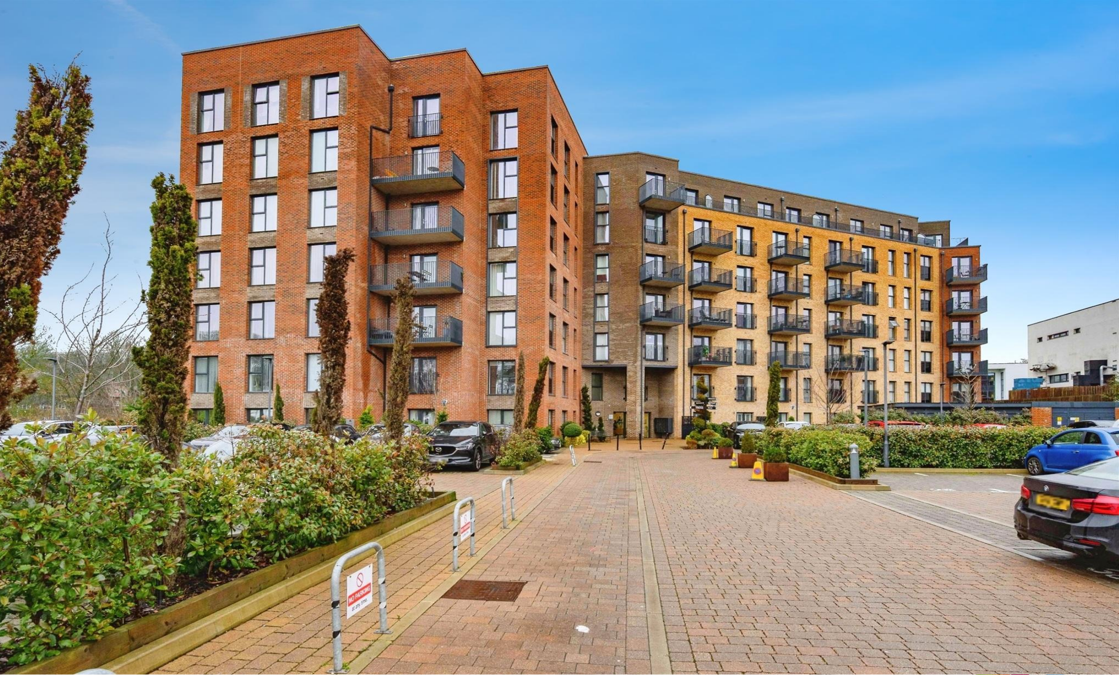
The Foundry Dacorum Way, Hemel Hempstead HP1 1BF