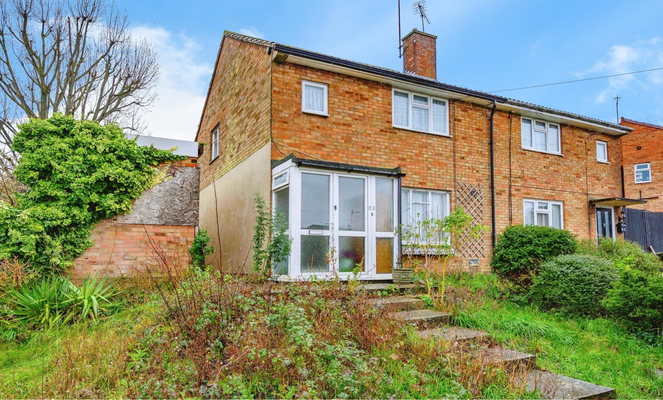
Toms Croft, Hemel Hempstead HP2 4LL