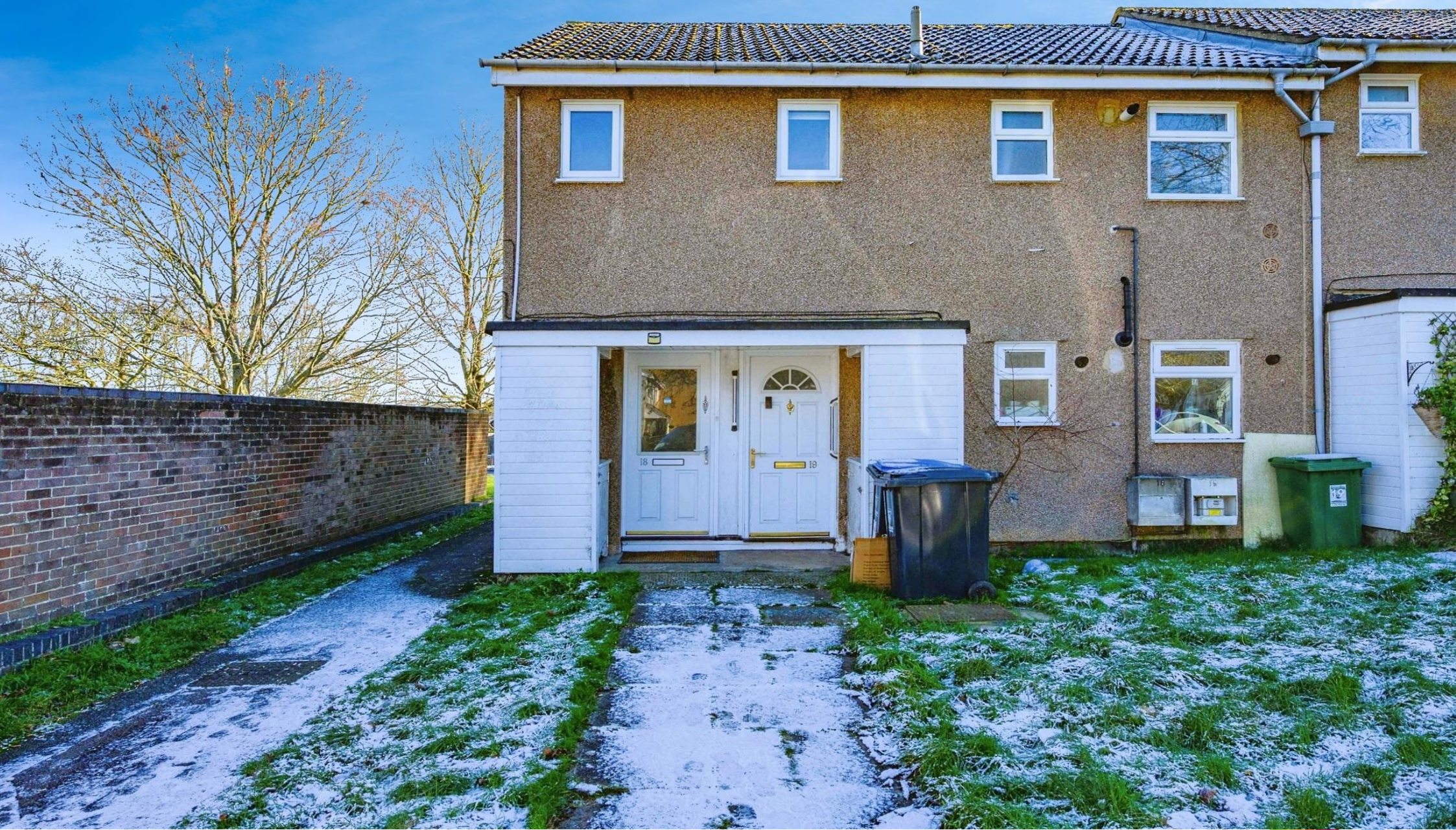
Claymore, Hemel Hempstead HP2 6LL