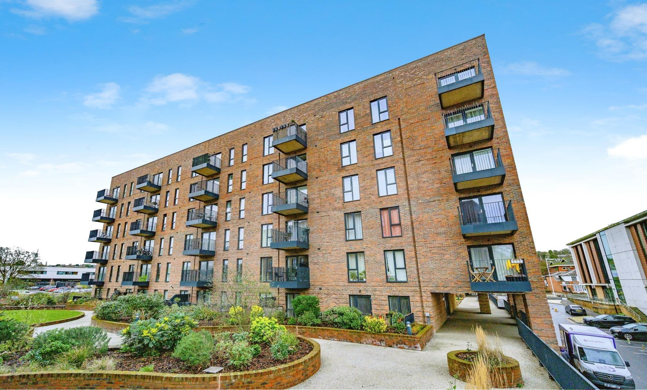
Augustus House Dacorum Way, Hemel Hempstead HP1 1DP