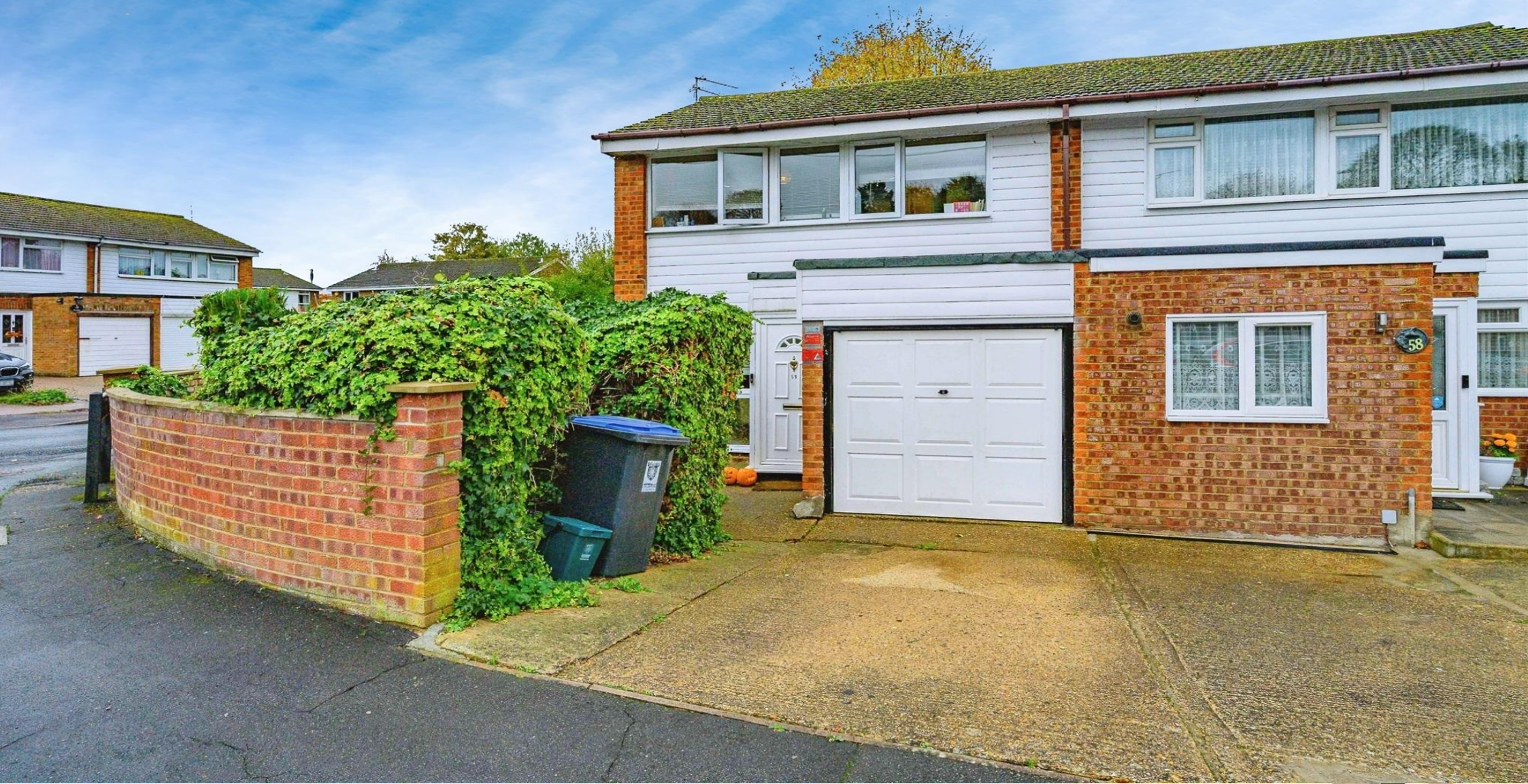
Kimpton Close,HEMEL HEMPSTEAD HP2 7PW