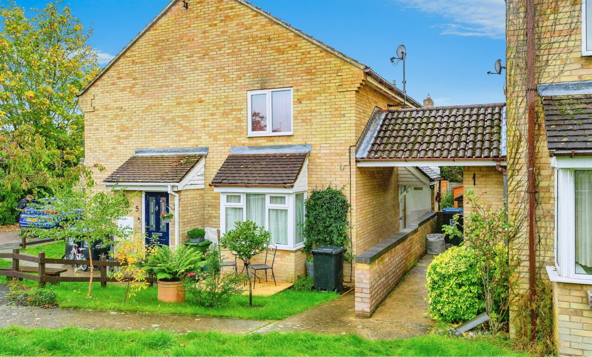
The Lawns, Hemel Hempstead HP1 2TF