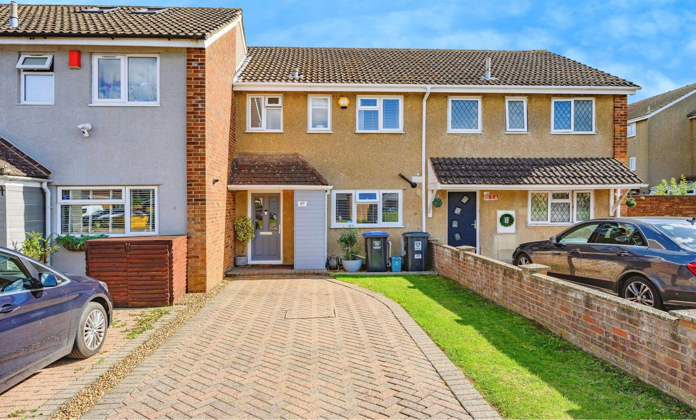
Claymore, Hemel Hempstead HP2 6LN