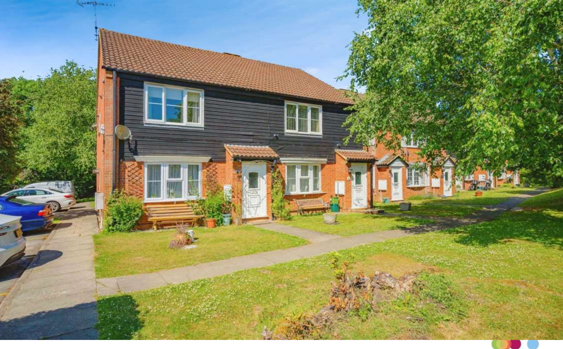
Northridge Way, Hemel Hempstead HP1 2AF