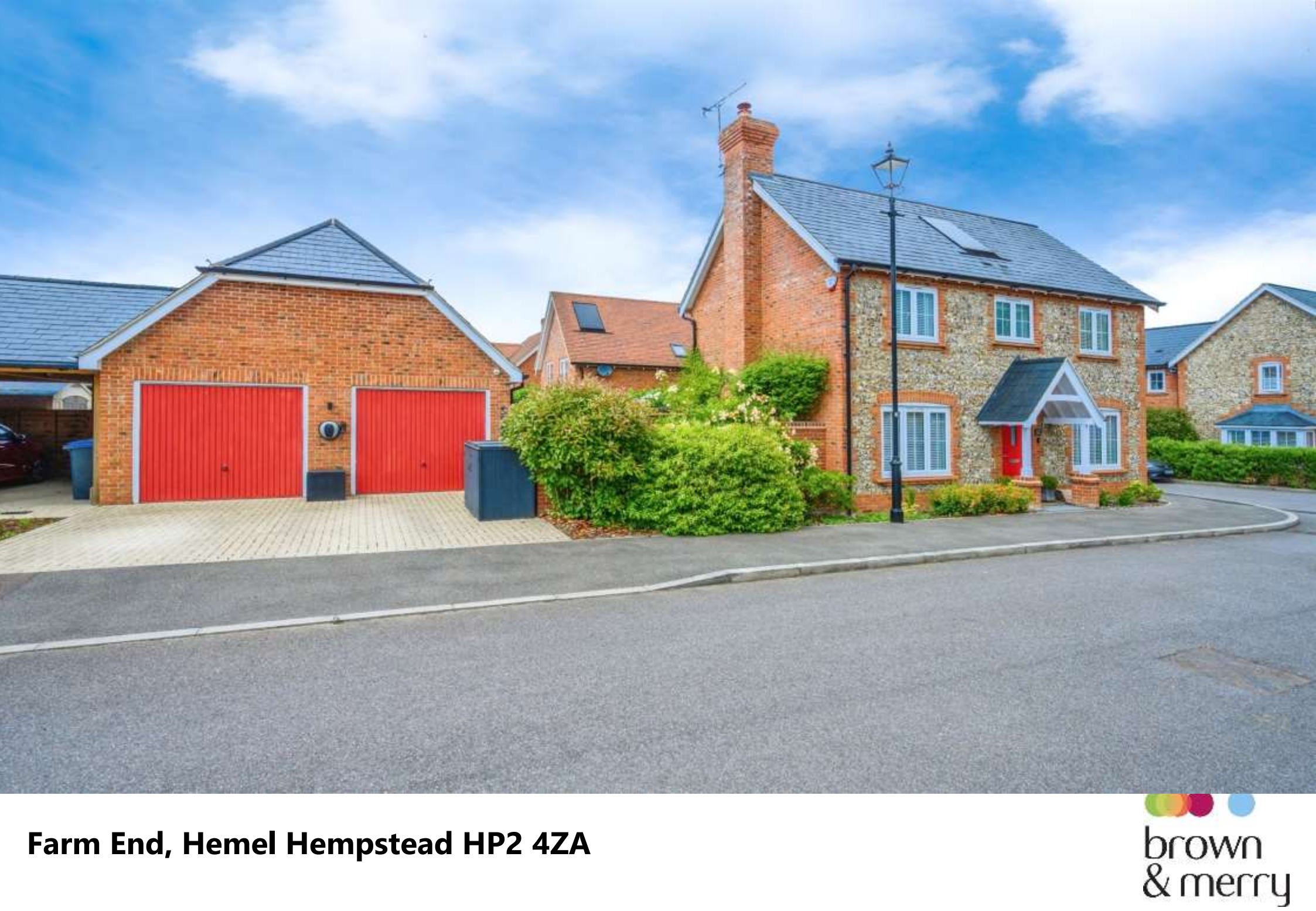
Farm End, Hemel Hempstead HP2 4ZA